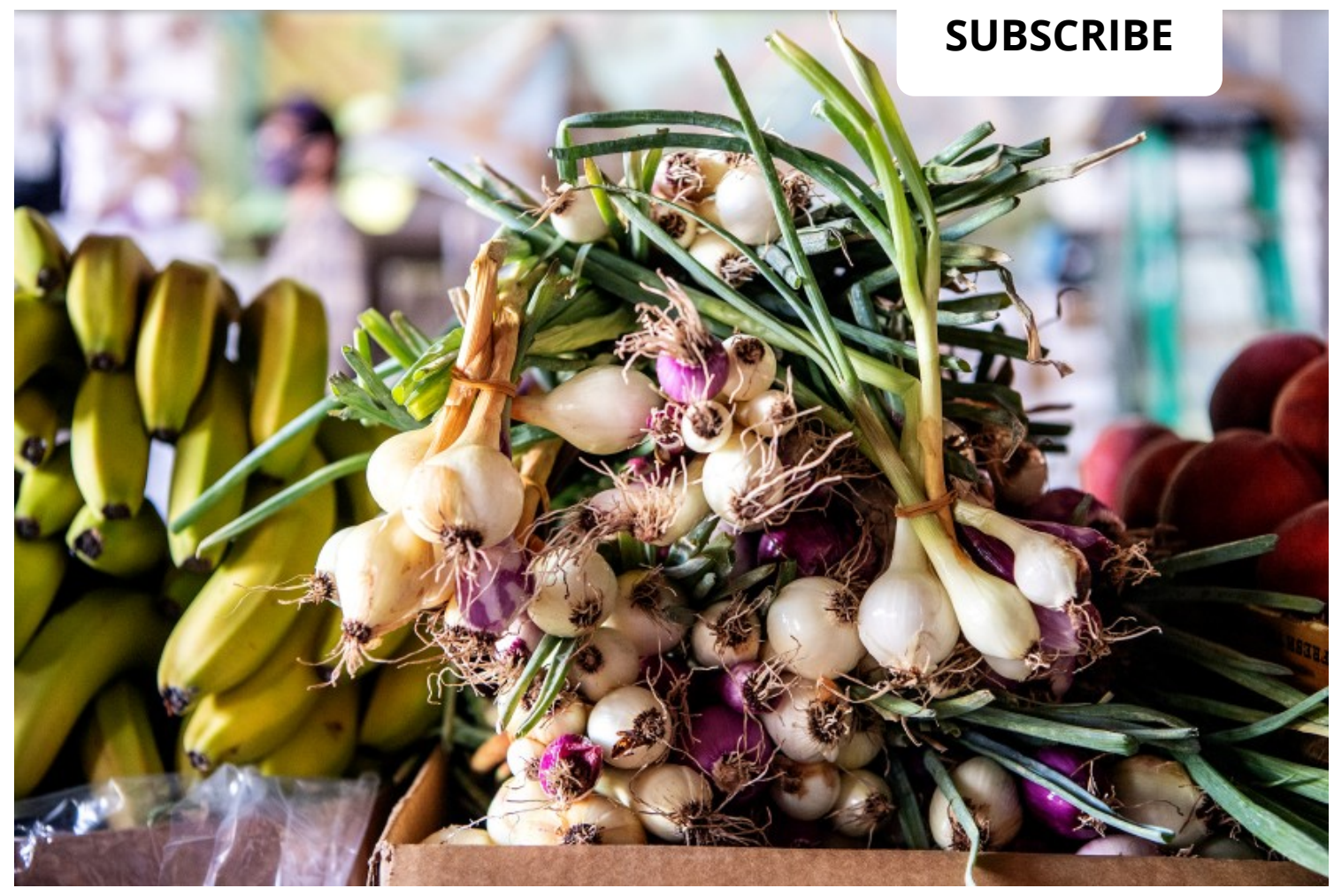
Fresh produce waiting to be packed at Summaeverythang.

Halsey briefly holed up in her studio for an "art vacation" but found she couldn't disconnect from the COVID- era realities of increased unemployment and food insecurity.