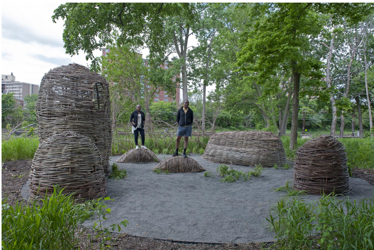
Documentation of blkHaUS studios, Sounding Bronzeville , 2016–present. Site-specific installation, Burnham Wildlife Corridor, Chicago

Human beings are natural collectors, be it of souvenirs found on vacations, heirlooms passed down from grandparents, or birthday cards received over the years. The items we hold on to reflect our social, cultural, and personal values. Likewise, museums tell stories by presenting all kinds of collected objects, which reflect the way they prioritize different social and cultural values.