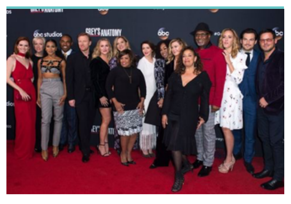
Why Are There No Filipino Nurses on Medical TV Shows?

Let these new and forthcoming titles welcome the changes to come in 2021.