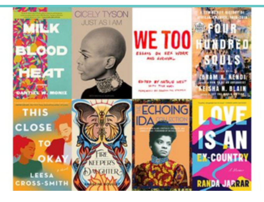
Colorlines Reads: Books for a New Year & New You